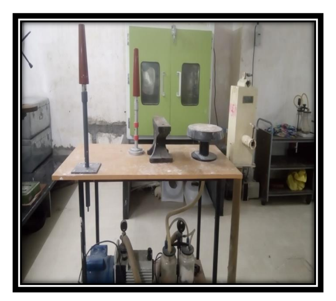
Single Hose Vacuum suction