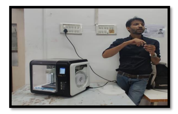
Page 25 of 29