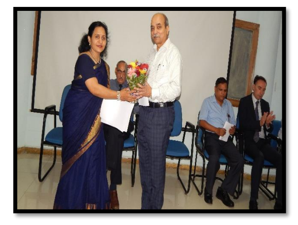
advanced Orion and linx prosthetics system which cleared the basic fundamental of biomechnaics and educated pratical aspects fitting prosthesis to amputee.

On 06<sup>th</sup> January 2020, a Programme "Need Based Product Design" was organized by MGMIUDPO under Institution's Innovation Council (IIC) Activity of MGMIHS for exposure